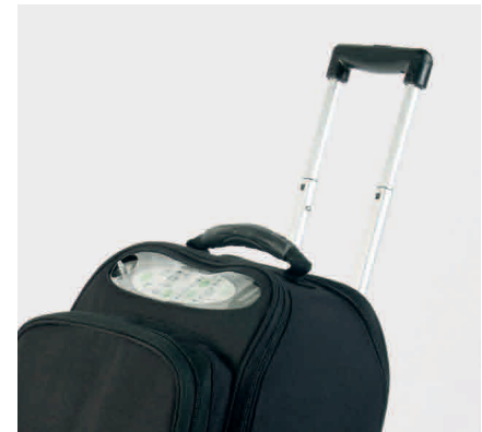
Wheeled carry case showing extendable handle