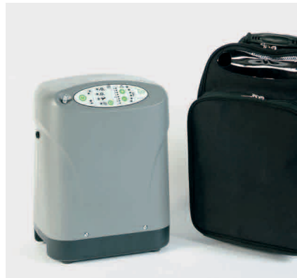
iGo and wheeled carry case

DeVilbiss Healthcare Ltd. Unit 5, 15 Carrington Rd Castle Hill NSW 2154 Australia Phone (02) 9899 3144 Fax (02) 9899 3244 www.devilbisshc.com