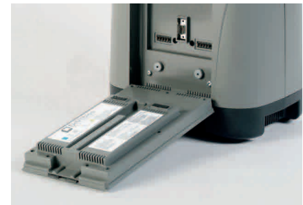
iGo Lithium ion Battery